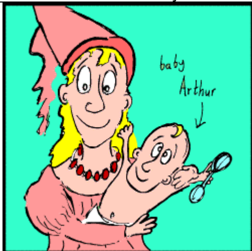
Uther and Igraine were married and they had a baby son, Arthur.