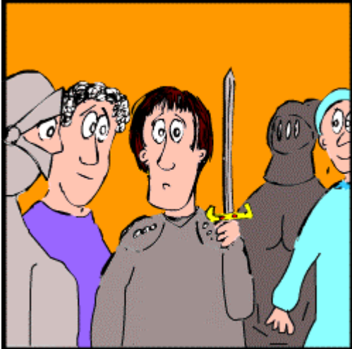
Word soon spread that Arthur had pulled the sword from the stone.