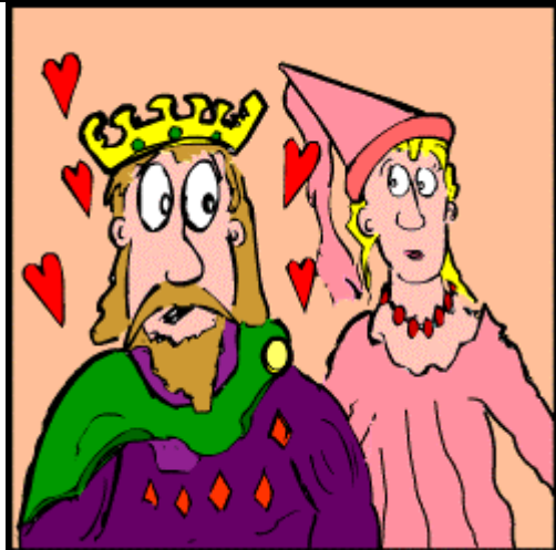
King Uther loved Igraine of Cornwall but he couldn't marry her.