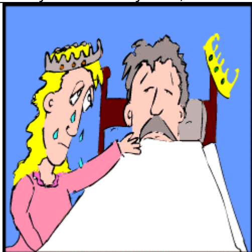
Many years later King Uther fell ill and died.