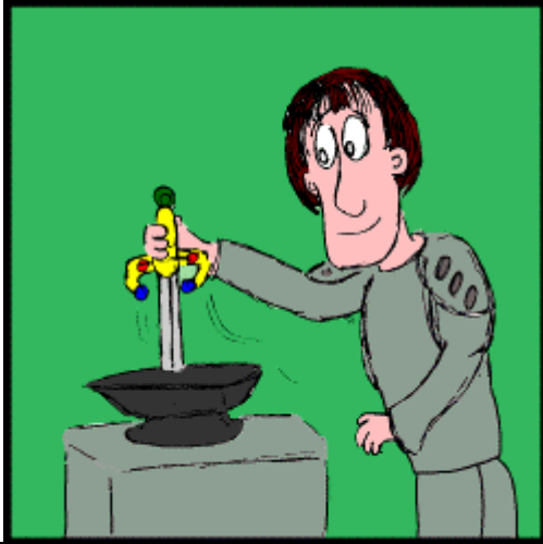
He decided to borrow the sword in the stone for Kay to use.