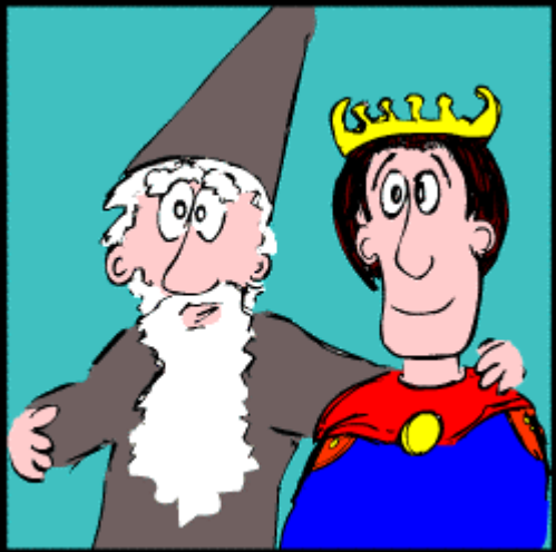
Merlin explained that Arthur was Uther's son and was the true born King of all Britain.