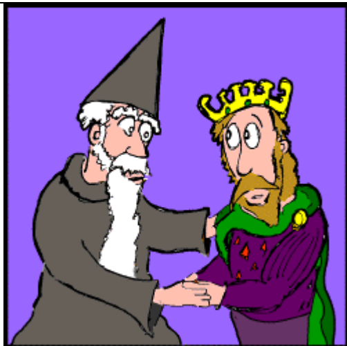
Merlin, the magician, said he would help if Uther gave him his first son.