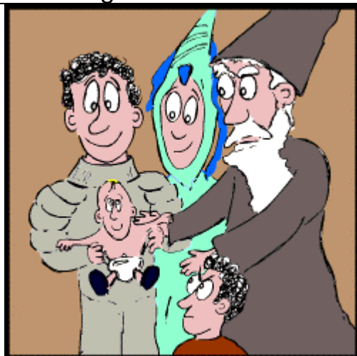
Merlin took Arthur and gave him to Sir Ector and his family to look after.