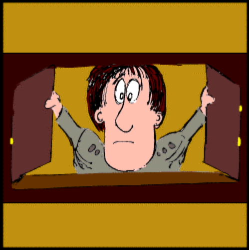
Arthur went back to get it but he couldn't find it.